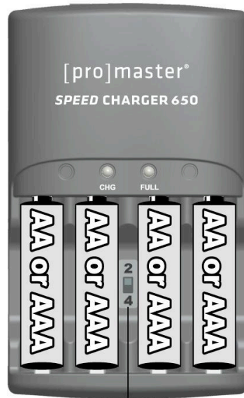
Switch set at "4"