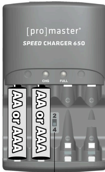
Switch set at "2"